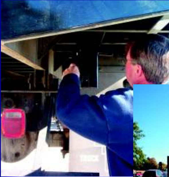
Step 1 Remove bolt from pocket.

Shingle-Vator is a lightweight, yet strong and durable shingle conveyor that can be easily removed and installed on your truck