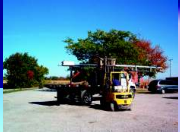
Step 3 Remove conveyor with a fork truck.