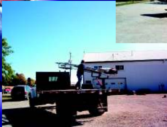
Step 2 Swing unit out to side or rear of truck bed and level.